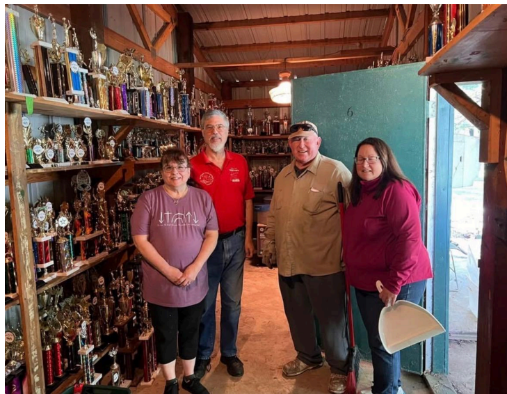
Trophy room was packed! You couldn't see the floor when we started.