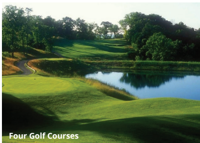
Four Golf Courses

This all-season luxury resort offers four golf courses on property and is close to vibrant downtown Galena. The property also includes a relaxing spa, various dining options, indoor pool, and relaxing atmosphere.